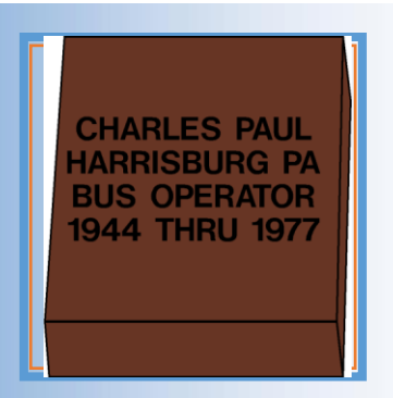
8"x 8" BRICK with up to 4 Lines of inscription 14-Characters per line