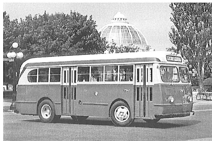
(left) FORD TRANSIT Representing a TTC Ford of the 1940-1946 era, this unit is preserved and is on display at the Halton County Radial Railway (Rockwood, Ontario).