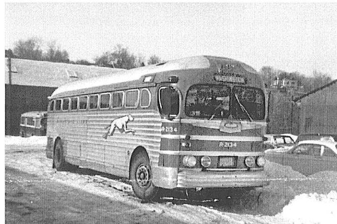
GM PD 3751 (right) Pictured at the Trans-Bridge Lines facility in Phillipsburg, NJ in the winter of 1961. This coach brought a charter group to nearby Lafayette College.