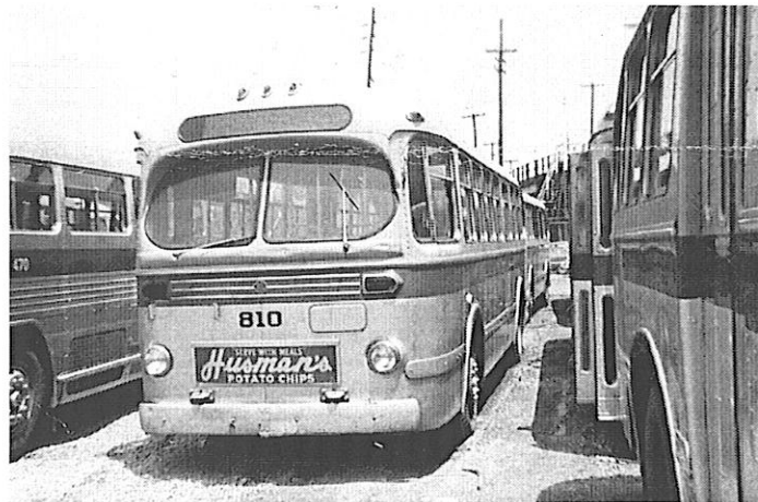
(left) ACF-BRILL C-36 Former Harrisburg Railways Co. #810 rests in the storage yard of sister ATE property Cincinnati, Newport and Covington (CNC) in the summer of 1959. These buses were only used for a short time while in CNC hands.