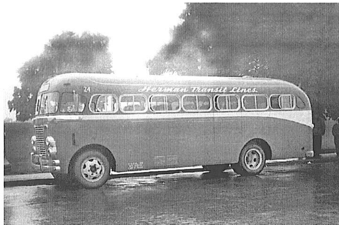
FITZJOHN DURALINER (right) 1949 Fitzjohn Duraliner while it was on a charter to Washington, DC in May of 1950. The operator was Herman Transit Lines (Ohio).