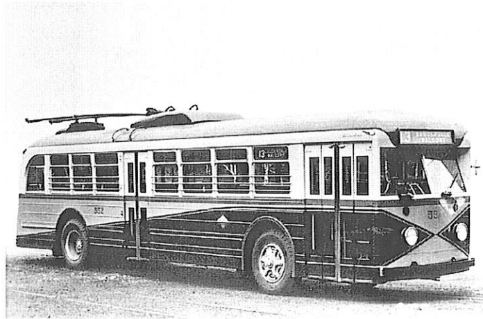
(left) Pullman-Standard TT Memphis Street Railways No. 552 was produced in 1942 and provided dependable transportation for thousands during the War years.