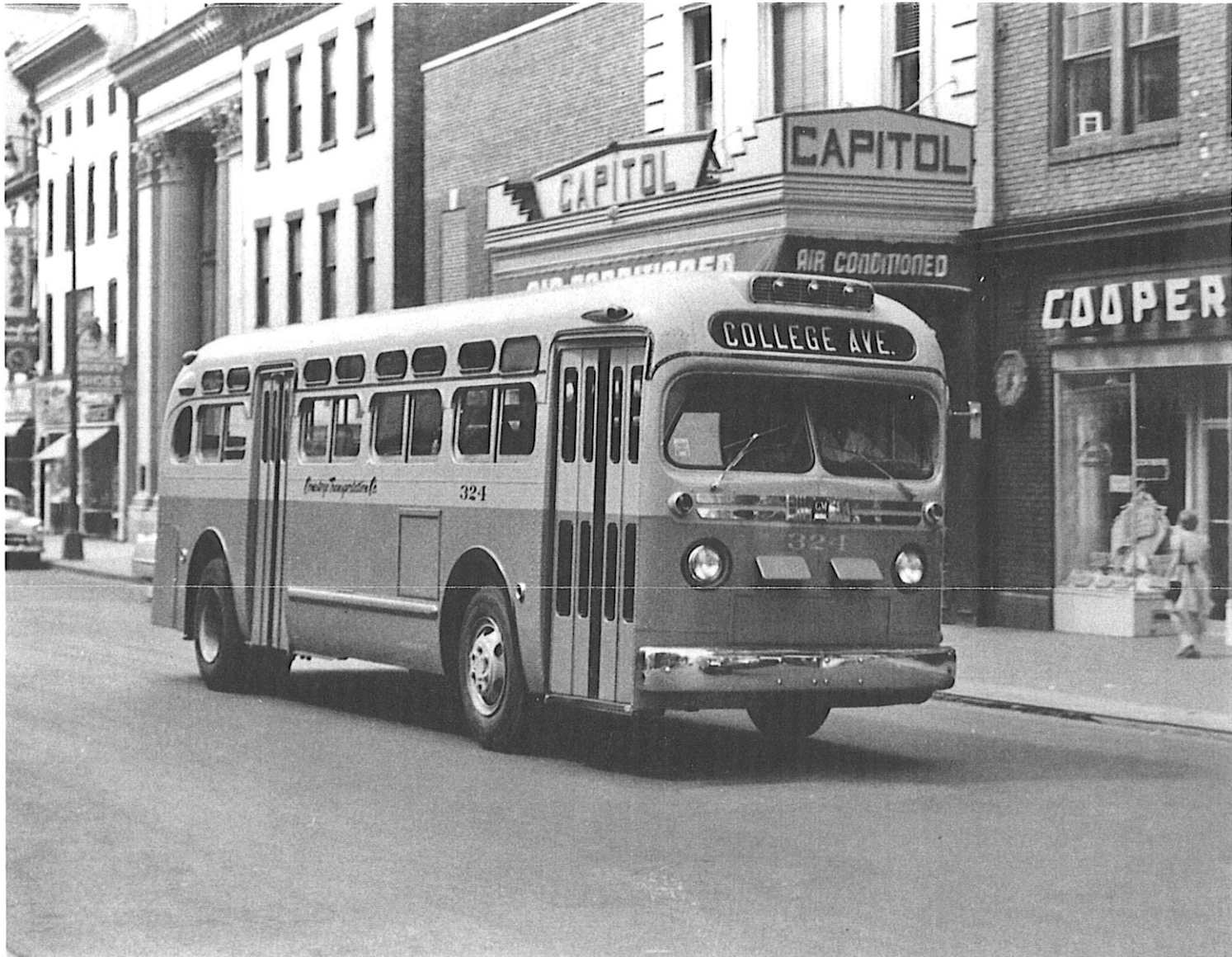
1954 GM TDH 3714 – Conestoga Transportation Co. – June 5, 1955