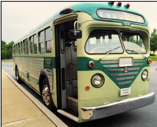
The Forrest Gump bus on display

A great day is planned for the bus enthusiast! Make sure to make plans to attend!